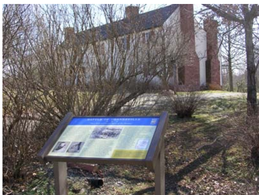
New VA Civil War Trails Sign with Dranesville Tavern in the background