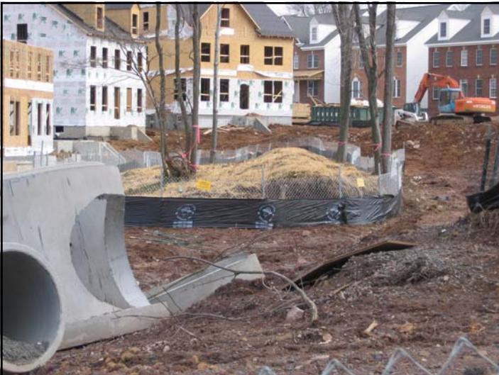
Remains of Confederate earthworks at Stanley Martin's "The Village at Mount Gilead" in the Centreville Historic District. Ten of Stanley Martin's forty-seven homes were allowed to encroach into the district by the Fairfax County Board of Supervisors in 2004. Subsequently the developer's heavy equipment ran over the entrenchment during construction. Photograph was taken during the BRCWRT's Tour 12 March 2005.

Four years ago, Stanley Martin Homebuilding was permitted by the Board of Supervisors (BOS) to build ten of its 47 large homes on a two-acre area within the Centreville Historic Overlay District. This ill-advised rezoning was opposed vehemently by historical groups who cared about the Civil War heritage of old Centreville and about the gross intrusion of Stanley Martin's high-density development into the low-density historic district.