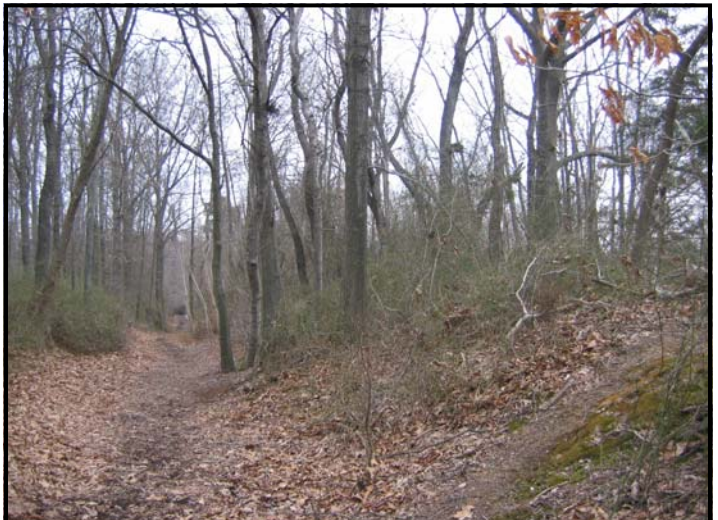
Photograph of the "Covered Way" earthwork was taken during the BRCWRT's Tour 12 March 2005.

This is the only Confederate winter encampment area left in the Centreville area. Most of Civil War Centreville is gone and lies under asphalt, concrete, and development. We support a decision by the working group to include this winter hut site, along with the three surviving forts and the "Covered Way" entrenchment, within an expanded Centreville Historic District. And we support an acquisition by the County of all surviving Civil War earthworks and archaeological sites from the private owners.