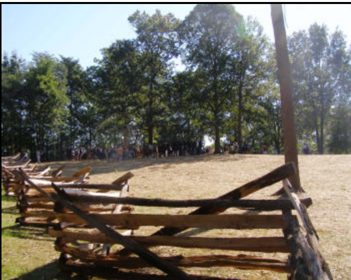
Cornfield fence at Ox Hill. This fence separates the Reid's cornfield on the left from the pasture on the right. The view is northeast toward the Kearny and Stevens monuments. Part of the 21st Massachusetts, urged on by Gen. Kearny, came right to left across this ground and entered the cornfield. The large gathering of people in the distance are attending the park's ribbon-cutting, September 1 st.