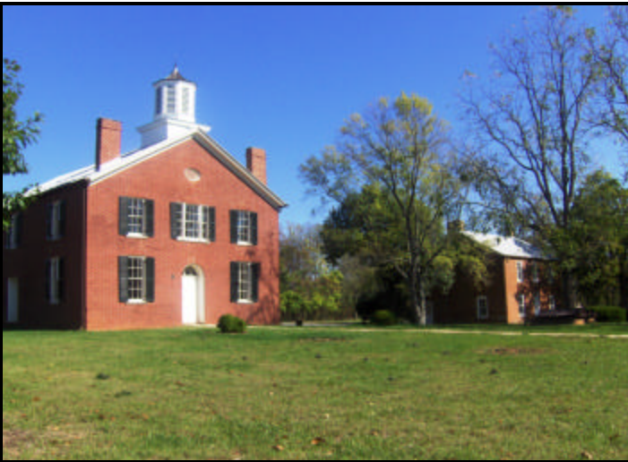
Brentsville served as the county seat of Prince William County between 1822 and 1893.