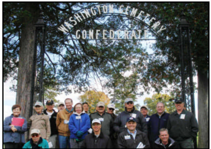
Part of our group at the entrance to the Washington Confederate Cemetery in Hagerstown

The weather was absolutely perfect! Our fall tour covered approximately 60 miles following Lee's retreat route during the period of 4-14 July 1863 from Gettysburg PA to Williamsport MD.