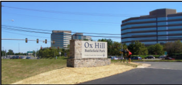
The park's new entrance on West Ox Road. The entrance drive leads to the parking area and covered kiosk. The kiosk presents an overview of the battle and is the starting place for the interpretive tour on the quarter-mile loop trail. The office building on the right is located close to where the 21st Massachusetts was nearly slaughtered by Trimble's brigade.

The Park Authority's Interpretive Team has been advised of the above errors and at some point in the future, perhaps after other mistakes have been found, corrections will be made. In the meantime, I'll consult with Brian and prepare a correction map showing the various Union movements through the streets of Washington.