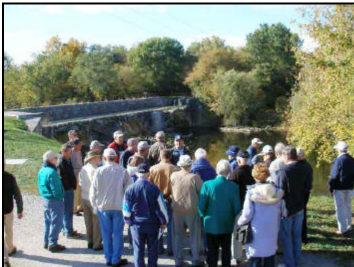
Williamsport, MD on the Potomac River

We parked near the Cushwa Basin along the river bottom where between 4,000 and 5,000 wagons were crowded together in squalor and the filth of 30,000 horses and mules while waiting for the river to recede. Finally, on 14 July, Lee successfully extracted his army from the clutches of the pursuing Federals and continued his retreat up the valley into Virginia.