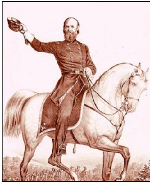
Depiction of the popular general August Willich.

Willich was promoted to brigadier general in July 1862, and fought under General Don Carlos Buell at the battle of Perryville. In the XX Corps, he fought in the Tullahoma Campaign, Chattanooga Campaign, and his 32 nd Indiana captured Orchard Knob. He said to his men: "My poys, you kills me mit joy, you kills me mit joy." The 32 nd was the first to reach the top of Missionary Ridge.