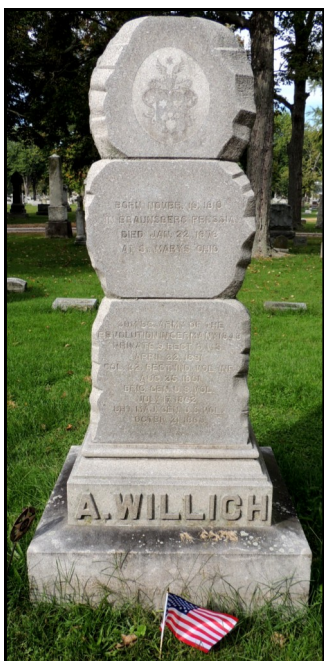
Gen. Willich's gravesite in St. Mary's, Ohio, and close-up of inscription.