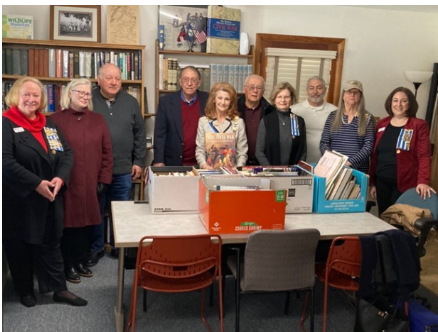
NSDAR Representatives and their husbands with the donated book collection.