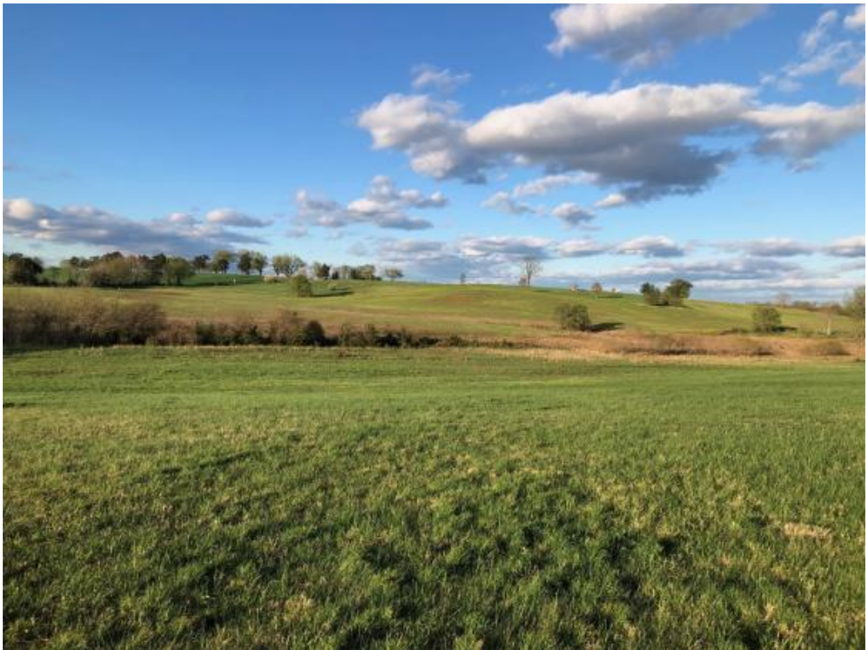
Fleetwood Hill at Brandy Station Battlefield in Culpeper County, Virginia