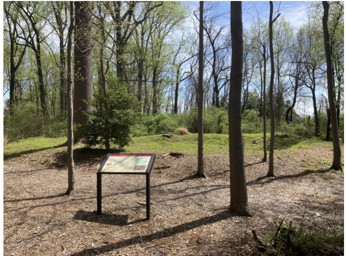
Civil War Redoubt at Farr's Cross Roads

The ceremony will be followed by a site tour for attendees, who wish to participate and learn more about the site's history. So, come on out and help celebrate and enjoy what promises to be a fun and enlightening event. Stay tuned for additional program information which is scheduled for publication in the near future.