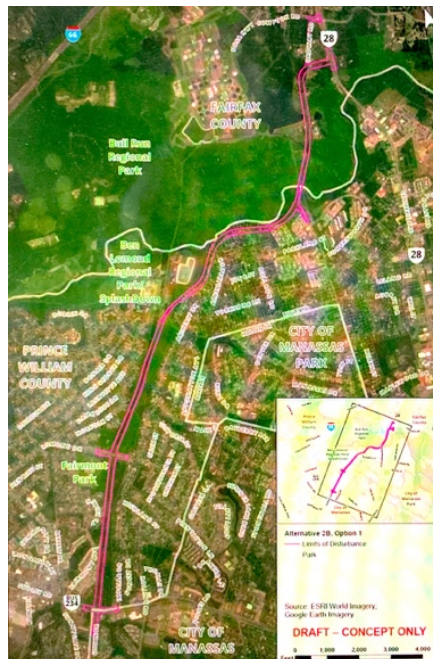
Route 28 ByPass - Godwin Road Extension (PWC DOT Presentation)

The Northern Virginia Transportation Authority (NVTa)'s Route 28 Transportation Study and Project is focused on infrastructure projects to improve travel times and network reliability on Route 28 through Prince William County, the City of Manassas and the City of Manassas Park.