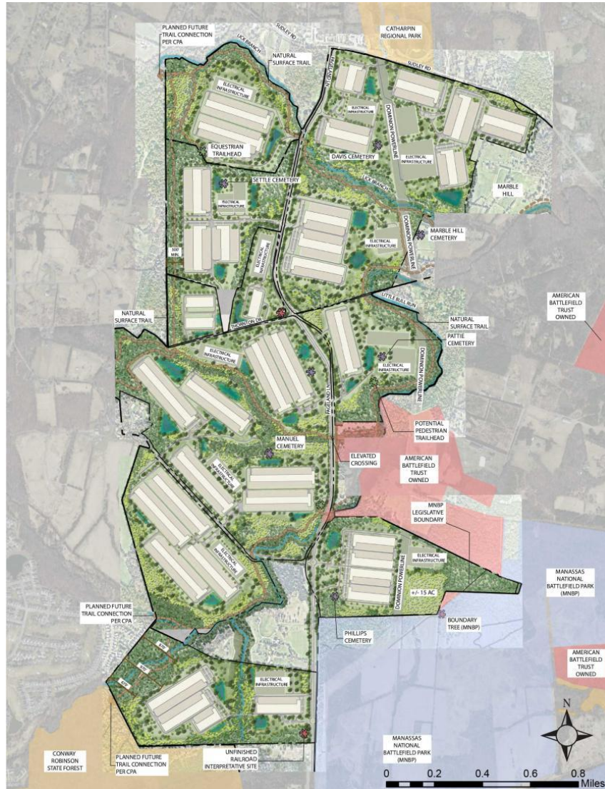
A rendering of what would be the largest data center campus proposal in the world – including its relationship to Trust-protected land! Click here to enlarge.

Rendering of Proposed PWDG Data Centers