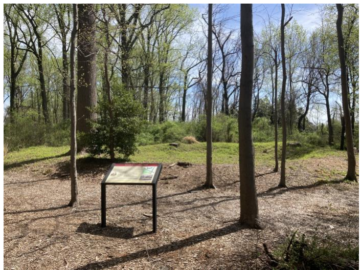
Civil War Redoubt at Farr's Cross Roads

The ceremony will be followed by a site tour for those who wish to learn more about the redoubt and the site's history. Join us and help celebrate and enjoy what promises to be a fun and enlightening event. Come early to enjoy viewing the displays and interact with ceremony participants and other attendees.