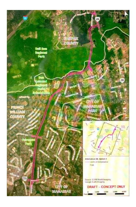
Route 28 ByPass - Godwin Road Extension (PWC DOT Presentation)

On February 18, 2021 Prince William County Department of Transportation (PWC DOT) hosted a meeting to inform residents about the Route 28 Bypass project, including background and current project status. The majority of time was reserved for questions from residents. Along with PWC DOT, panelists from the PWC Planning Office, Department of Public Works, and Parks, Recreation, and Office of Tourism were available to answer residents' questions. DOT's presentation provided a general overview of the project including the current timeline; Design and Engineering 2021 - 2023, Right of Way & Utilities 2023 - 2025, Construction 2025 - 2027. The majority of the meetings was devoted to resident questions and Panel member responses. A complete recording of the meeting, including the DOT presentation and the follow-on Q&A Panel, is available at <u>www.route28bypass.com</u>.