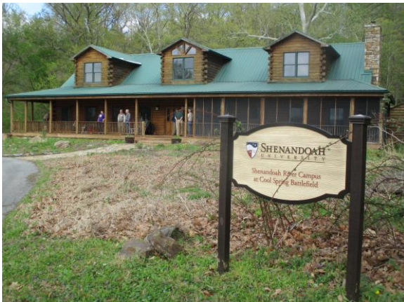
Shenandoah University's River Campus Lodge

9:00 am River Campus Lodge Open for Tour Participant Check-In 9:30 am - 11:30 am Battle of Cool Spring Walking Tour 12:00 pm - 1:30 pm River Campus Lodge Open for Visitation Optional lunch at a local eatery (Hill High Marketplace & Restaurant - 5.8 miles east of Cool Spring Battlefield on U.S. Route 7)