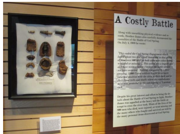
Artillery Artifacts from the Battlefield

Join us on Saturday, October 23, 2021 - registration is required. Register here