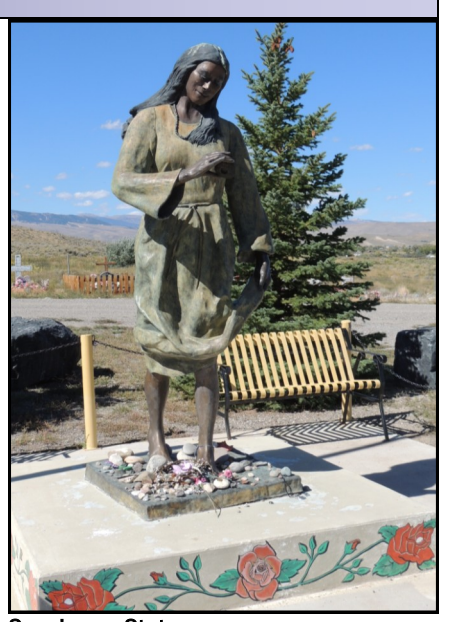
Sacajawea Statue.

because we never saw two roads. We finally came to a dirt road and turned down it, looking for cemetery. а There was nothina there that looked like a cemetery, and we were obviously someon one's land, as young two were men