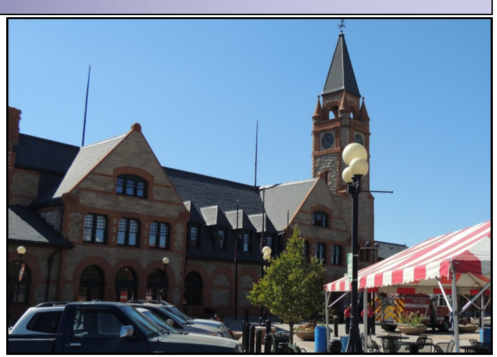
Laramie Train Station.

Transcontinental Railroad (at 8,247 feet). The Ames brothers were the main financiers for the railroad. President