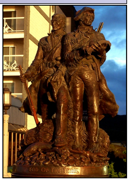
Lewis & Clark Statue - Seaside, OR.

This concludes the West trip. It is always interesting discovering that the Civil War extends all over this country of ours.