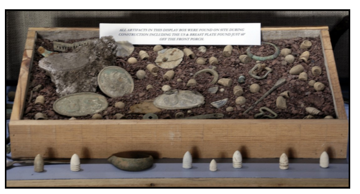
A Relic Display at the Winery at Bull Run.

The winery was built next to the foundation of Hillwood, which burned down in 1990. The Winery at Bull Run was built to represent two Northern Virginia farms; a small 1800s-era barn and a larger 1920s dairy barn, complete with a hayloft and hay lift cable. The "little barn" entrance to the tasting