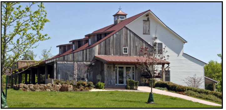
Entrance to The Winery at Bull Run