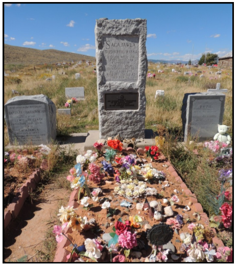
Sacajawea Grave.

both told us that they were good Shoshone, and would not have hurt us - they had obviously seen our concern when they said, "follow us." For two women travel-