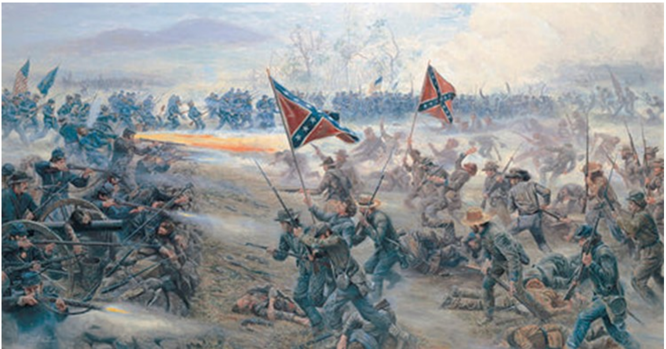
The High Water Mark was meticulously researched for historical accuracy. The painting was unveiled at the Gettysburg National Military Park Museum on July 2, 1988 in celebration of the 125th anniversary of the battle.