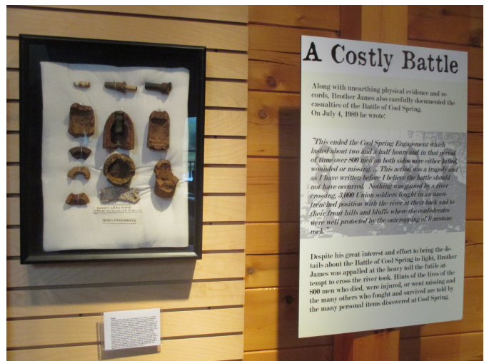
Artillery Artifacts from the Battlefield