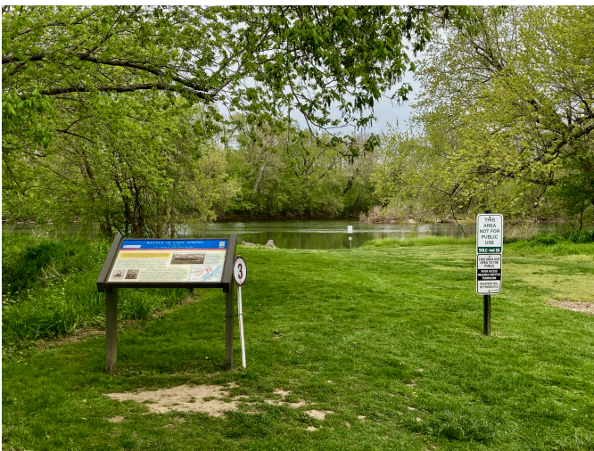
Walking Tour Stop #3 - Well's Bde Leads the Crossing