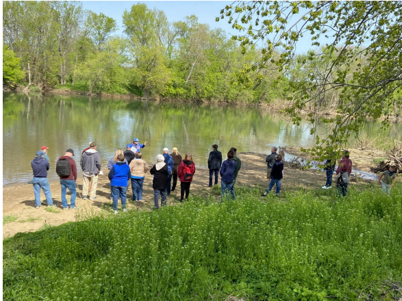
Recent MCWI Guided Tour in vicinity of Island Ford