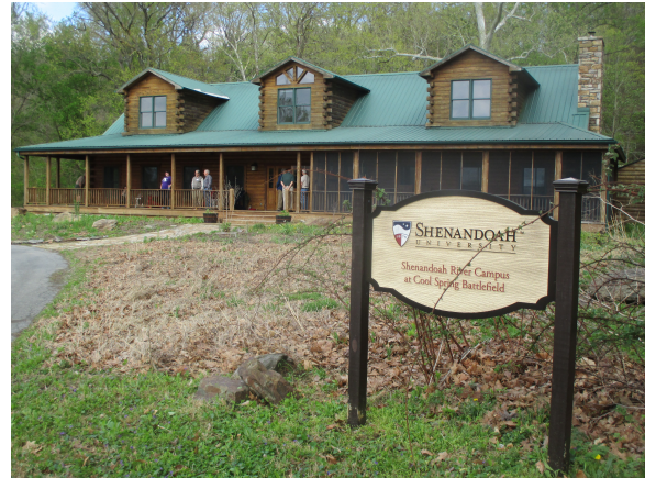
Shenandoah University's River Campus Lodge

Recently the American Battlefield Trust and Shenandoah University received the 2020 Wingate Mackay-Smith Clarke County Land Conservation Award for their partnership in preserving the Cool Spring Battlefield. The following Press Release was distributed by the American Battlefield Trust (ABT):