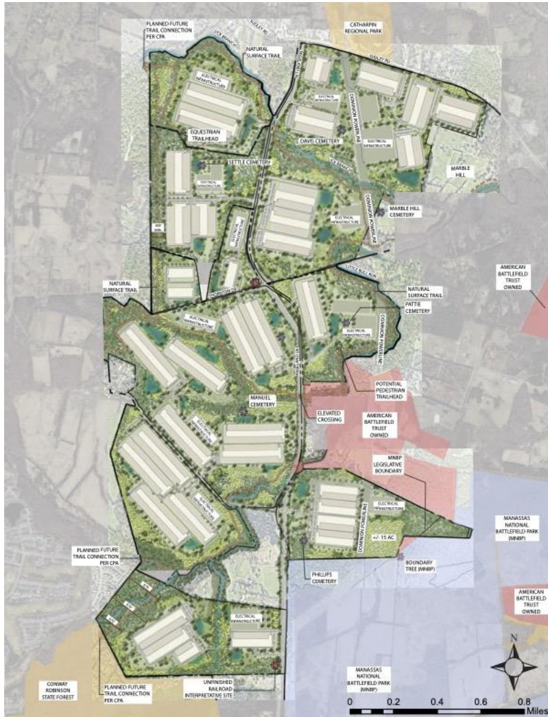
Rendering of the Proposed PWDG Data Centers depicting the proposed data centers' site schematics in relation to adjacent historic sites within the Manassas Battlefield Historic District, Manassas Battlefield National Park (MNBFP) and Manassas Battlefield Core Area land currently owned by the American Battlefield Trust and planned for eventual incorporation into MNBFP.