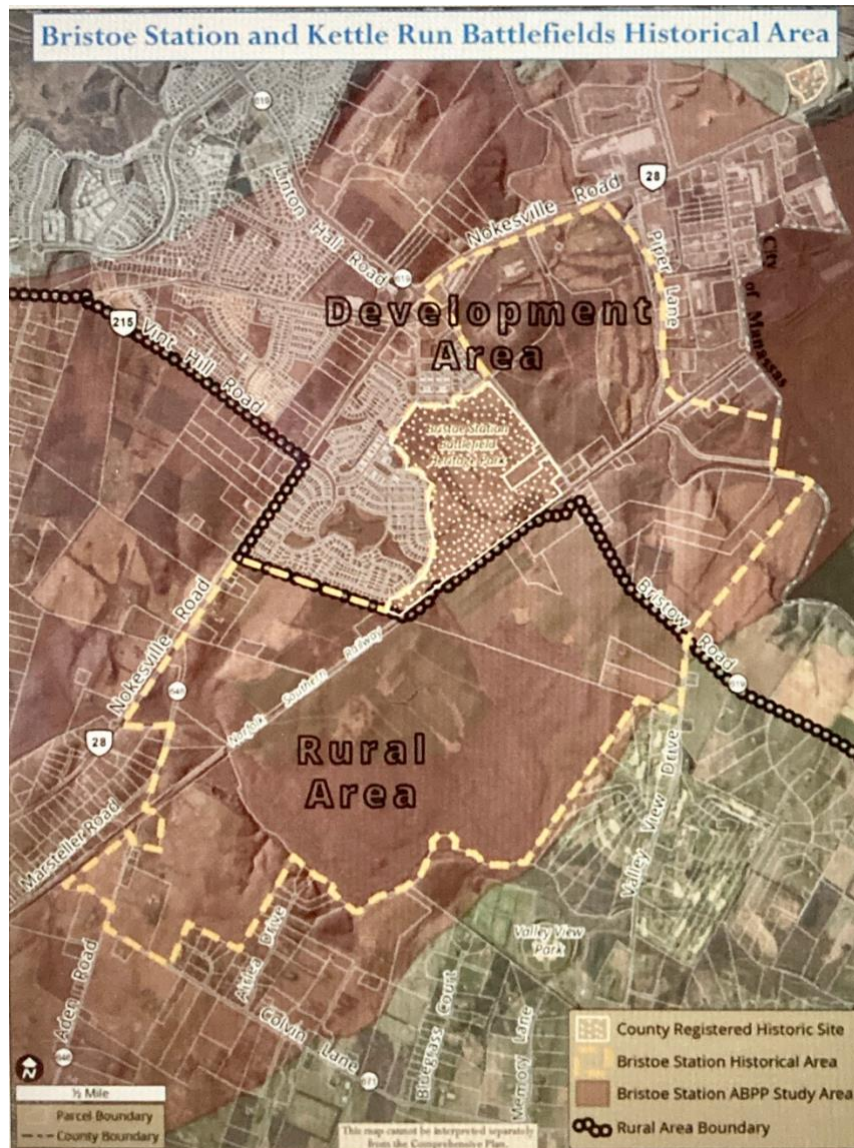
Bristoe Station and Kettle Run Battlefields Historical Area.

POLICY 4: Where preservation is not feasible in the Development Area, apply appropriate mitigation measures to new development within the Bristoe Station and Kettle Run Battlefields Historical Area.