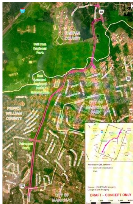
Route 28 ByPass - Godwin Road Extension (PWC DOT Presentation)

On February 18, 2021 Prince William County Department of Transportation (PWC DOT) hosted a meeting to inform residents about the Route 28 Bypass project, including background and current project status. The majority of time was reserved for questions from residents. Along with PWC DOT, panelists from the PWC Planning Office, Department of Public Works, and Parks, Recreation, and Office of Tourism were available to answer residents' questions. DOT's presentation provided a general overview of the project including the current timeline; Design and Engineering 2021 - 2023, Right of Way & Utilities 2023 - 2025, Construction 2025 - 2027. The majority of the meetings was devoted to resident questions and Panel member responses. A complete recording of the meeting, including the DOT presentation and the follow-on Q&A Panel, is available at www.route28bypass.com .